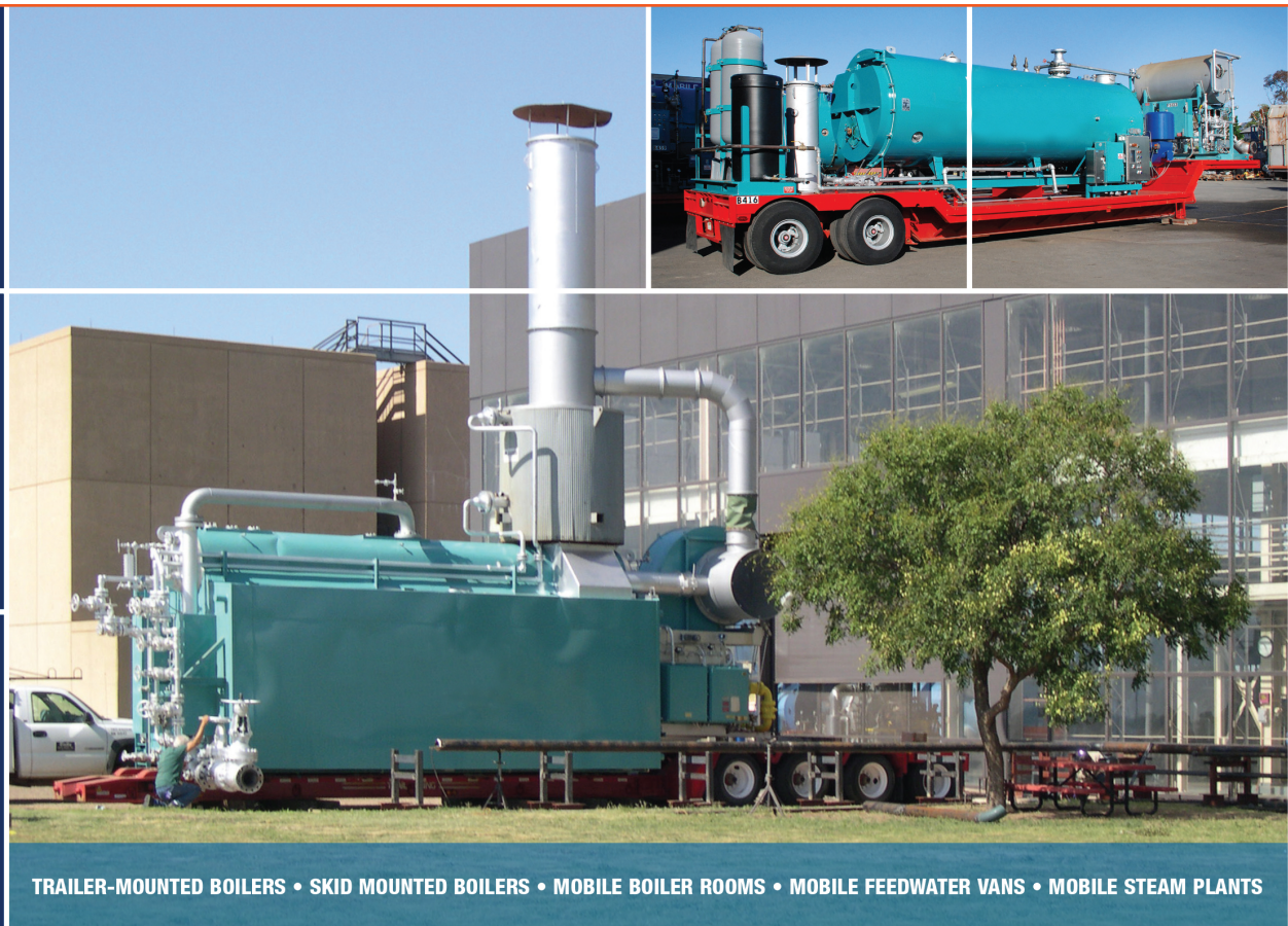
TRAILER-MOUNTED BOILERS • SKID MOUNTED BOILERS • MOBILE BOILER ROOMS • MOBILE FEEDWATER VANS • MOBILE STEAM PLANTS